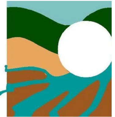
Bremer Catchment Association Inc